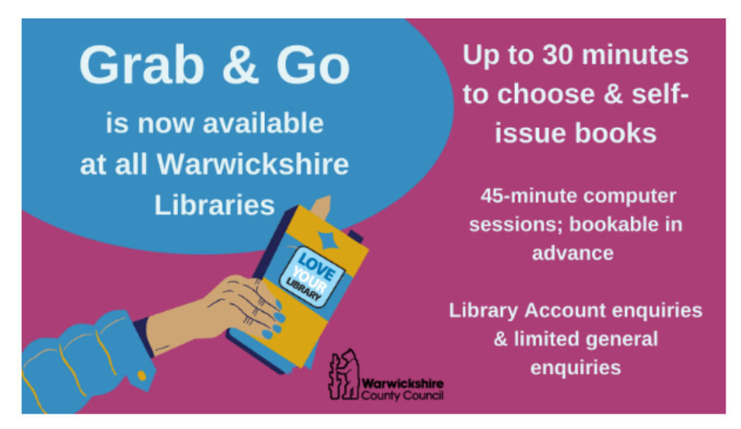
'Grab & Go' and stay safe in libraries from Monday 12 April.

Grab & Go service ; visit for 30 minutes to browse, borrow, collect requests and return. Visit at any time during the library's opening hours.