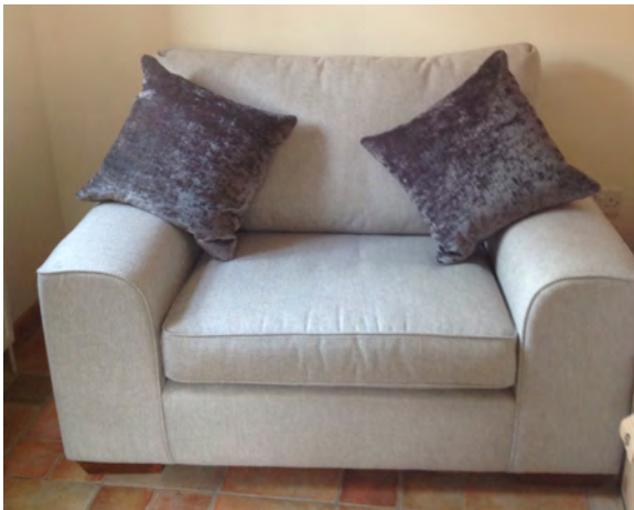
Silver grey 'Love seat' or oversized chair with contrasting dark grey scatter cushions and wooden feet £100 . Purchased from Whartons.