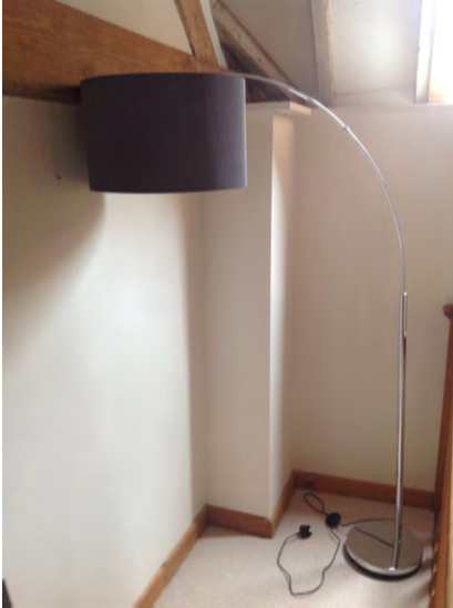
Curved/Arc Floor standing lamp, chrome with large grey pleated shade. Purchased from Next - £30

All items are for collection from Wolverton, Tel 07875 436370