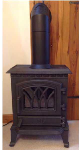
Electric Stove Heater. Cast Iron with detachable mock chimney/flue £40 . Supplied by Broseley Fires Shrewsbury.