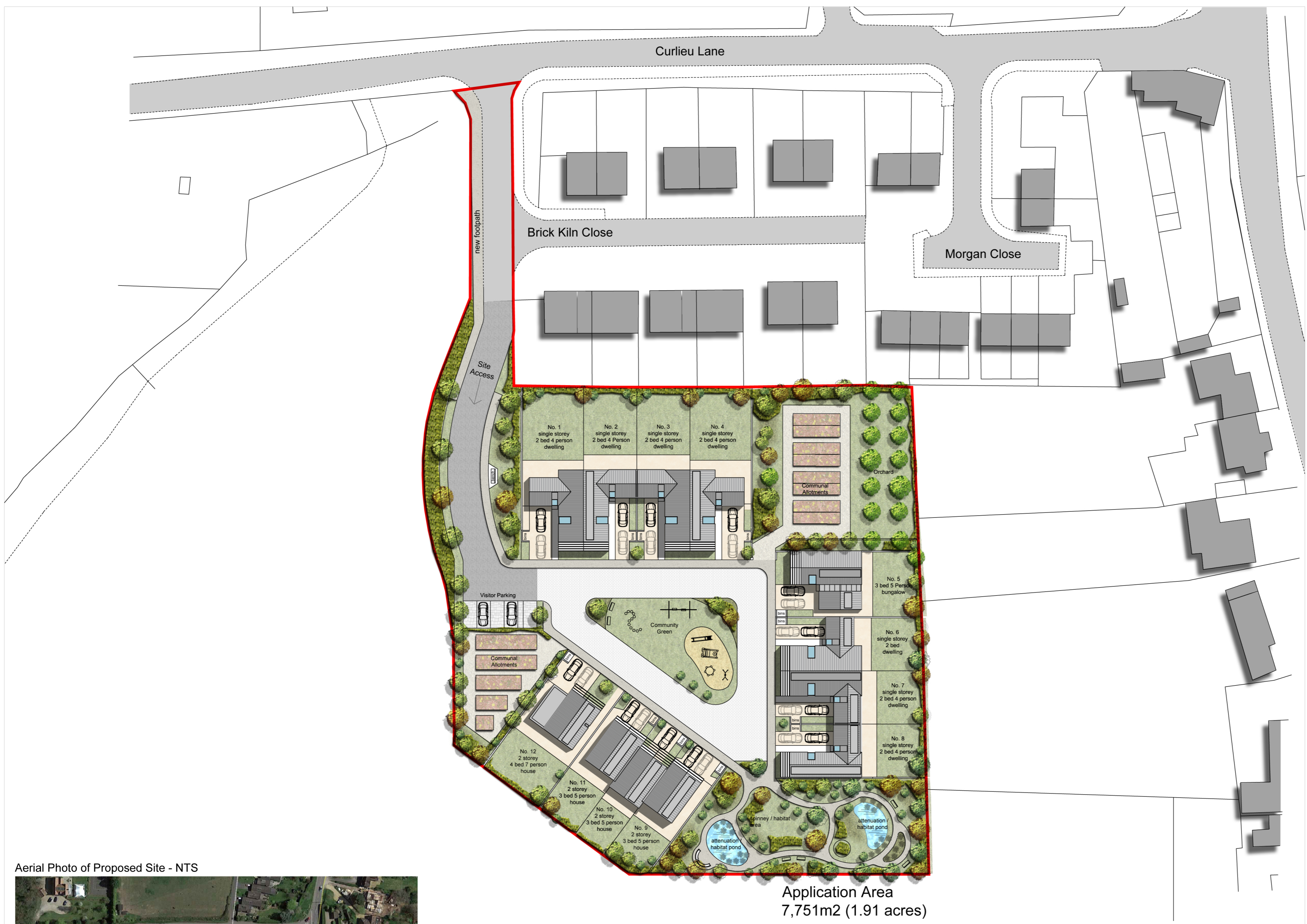
Aerial Photo of Proposed Site - NTS